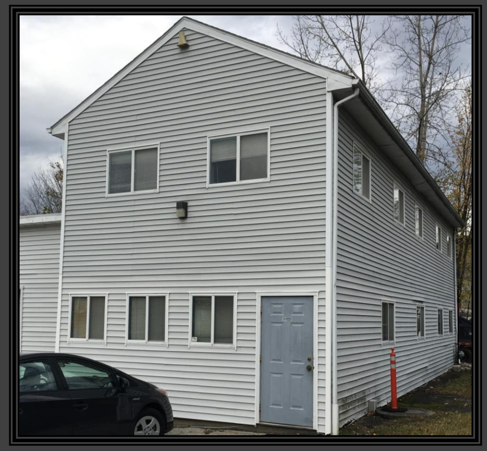
98 Wooster Street